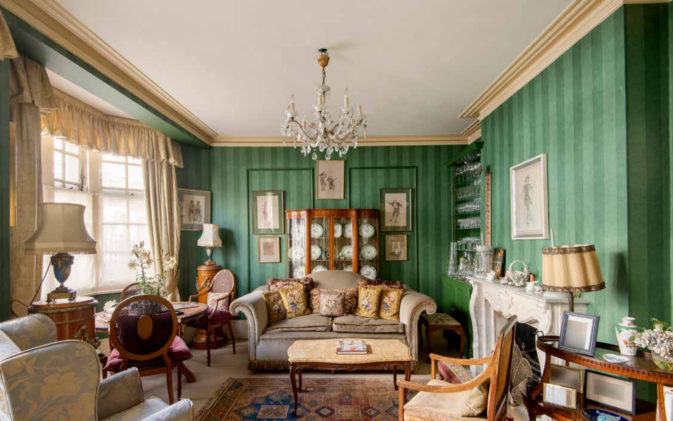
COLEHERNE COURT | OLD BROMPTON ROAD SW5