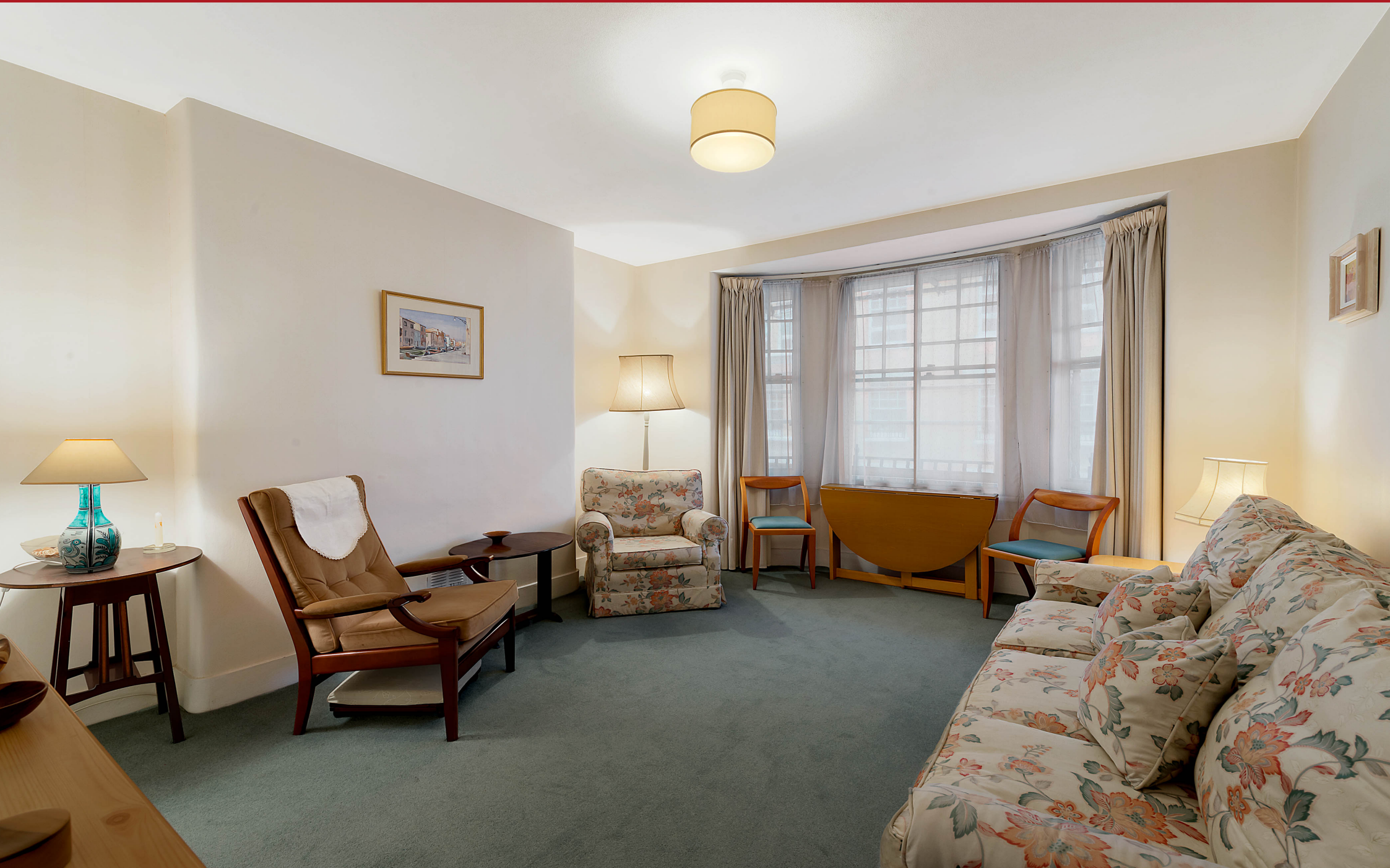
THE MARLBOROUGH KNIGHTSBRIDGE SW3