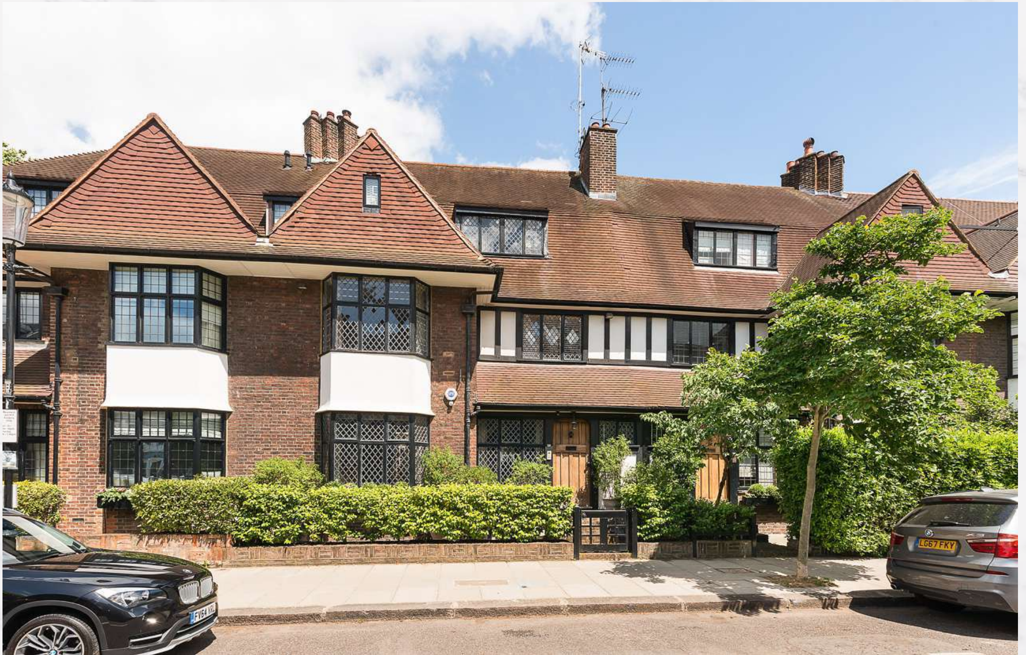
ORMONDE GATE CHELSEA SW3