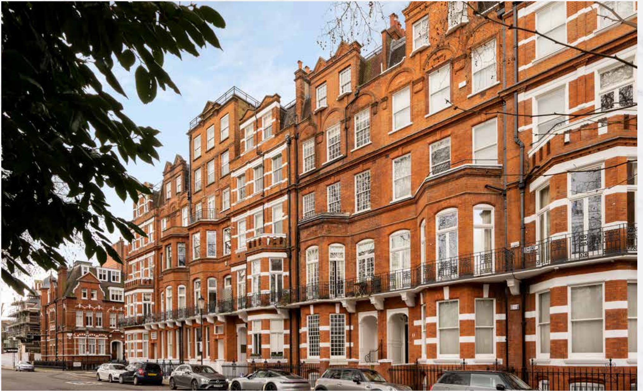
EGERTON GARDENS KNIGHTSBRIDGE SW3