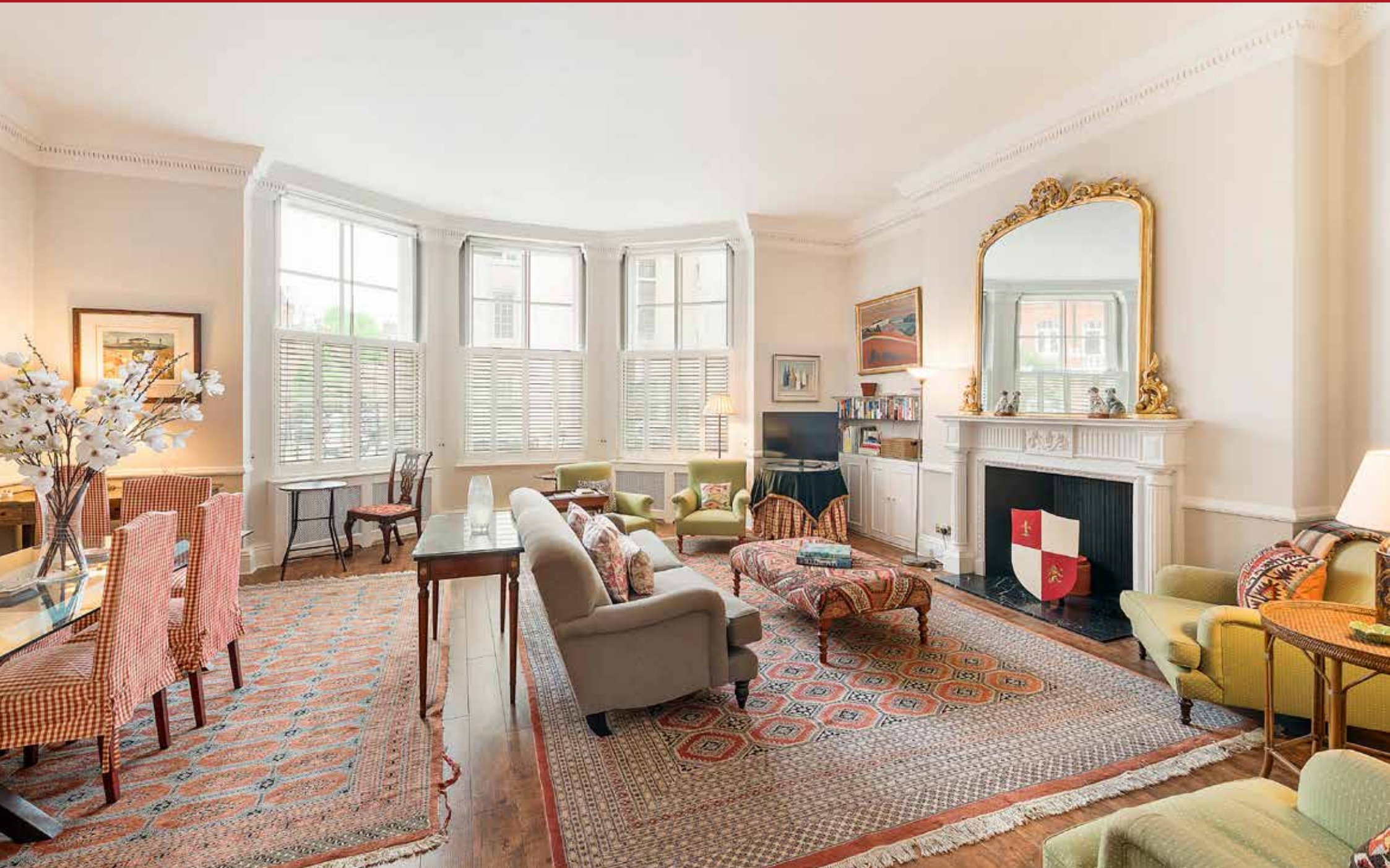
PONT STREET KNIGHTSBRIDGE, SW1X