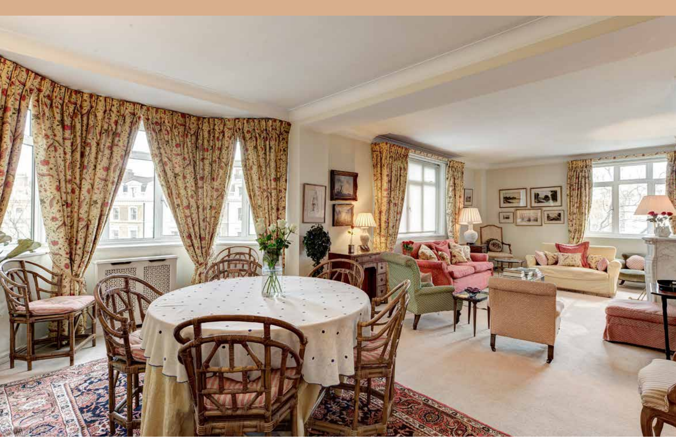
MELTON COURT LONDON SW7